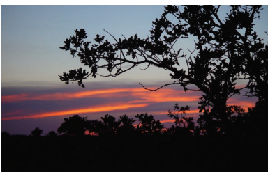
Summer Solstice 2010